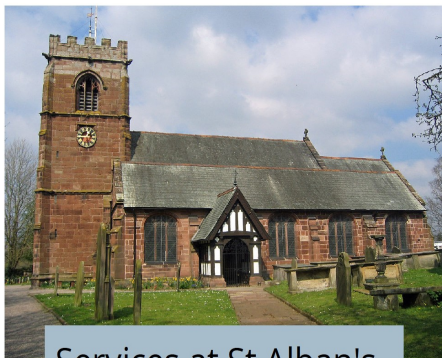
Services at St Alban's

St Alban's will be resuming services as follows